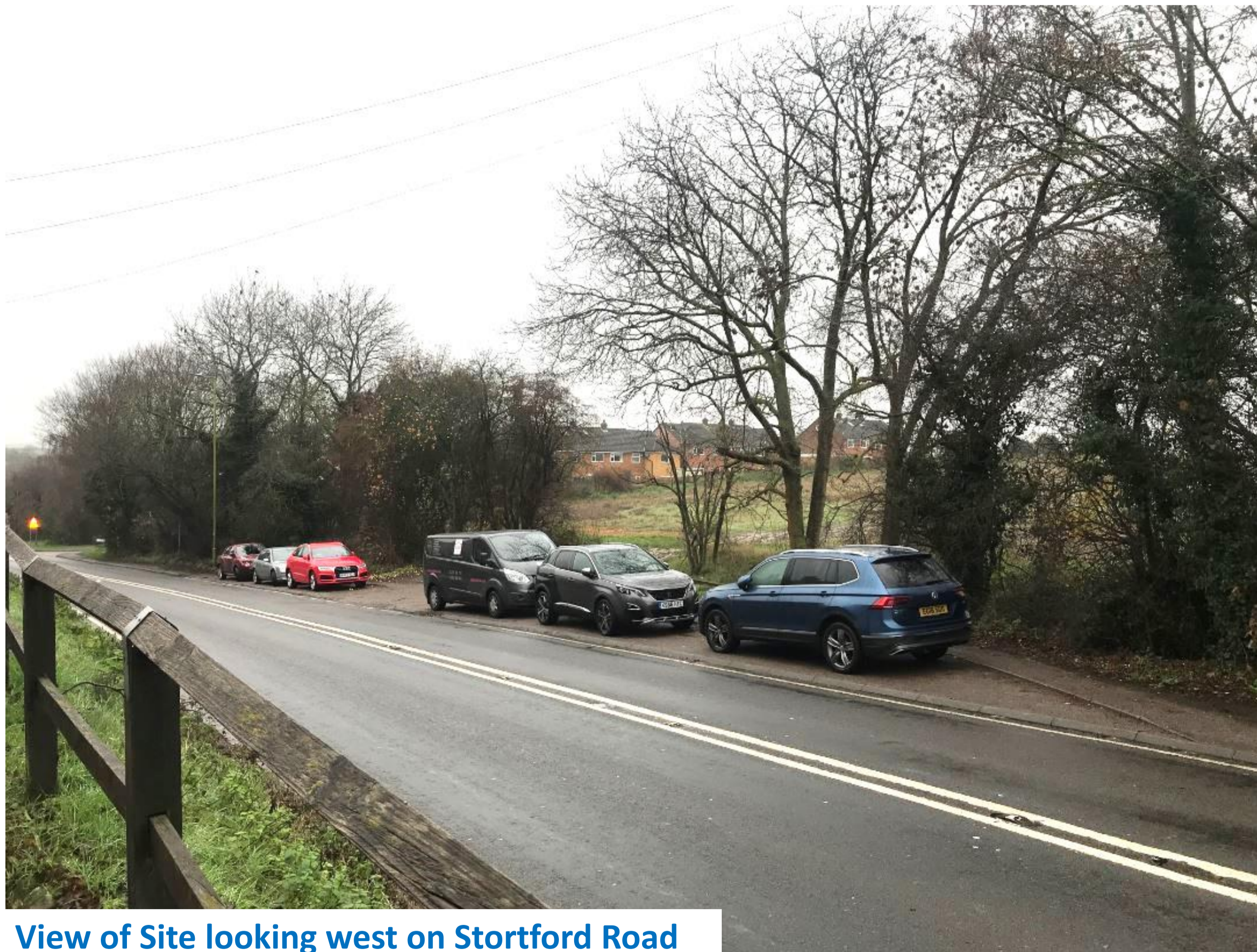
View of Site looking west on Stortford Road